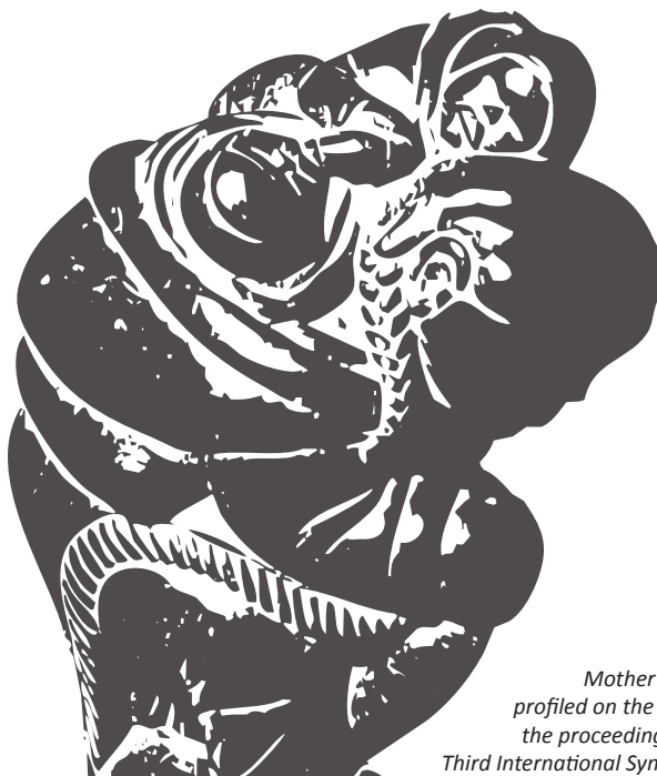
Mother & Child, profiled on the cover of the proceedings of the Third International Symposium on Circumpolar Health, July 1974 Yellowknife, NWT, Canada

Sponsors will be recognized in association with the specific activity or component they choose to sponsor or as an overall congress supporter. Sponsors will receive a range of sponsorship recognition and benefits according to the level of sponsorship as outlined in the following pages.